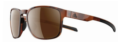
ad32 75 6000 BROWN HAVANNA BROWN