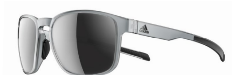
ad32 75 6500 CRYSTAL GREY CHROME MIRROR