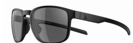
ad32 75 9000 BLACK MATT GREY