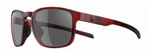
ad32 75 3000 RED HAVANNA GREY