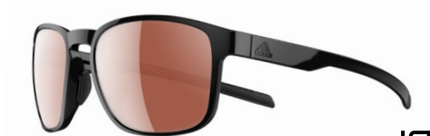
ad32 75 9100 BLACK SHINY LST LST™ ACTIVE SILVER