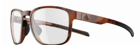
ad32 75 6100 BROWN HAVANNA VARIO (ANTIFOG) CLEAR - GREY / LENS CATEGORY: 0-3