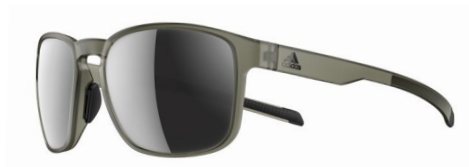
ad32 75 5500 OLIVE MATT CHROME MIRROR