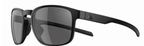
ad32 75 9200 BLACK MATT GREY POLARIZED