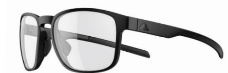
ad32 75 9300 BLACK MATT VARIO (ANTIFOG) CLEAR - GREY / LENS CATEGORY: 0-3