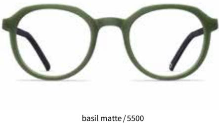
basil matte / 5500