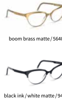
boom brass matte / 5640