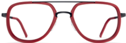
electric red / black ink matte / 3040

MODEL: T048 SIZE: 52 / 19 / 140 MATERIAL: stainless steel + 3D