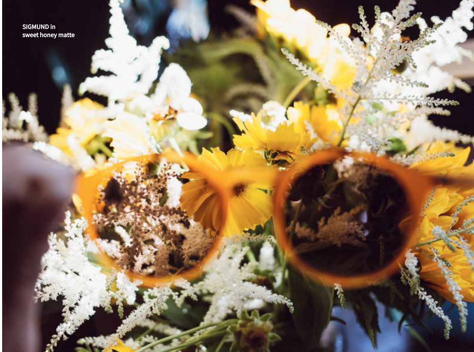
SIGMUND in sweet honey matte