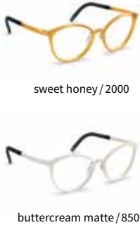
sweet honey / 2000