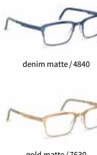
denim matte / 4840