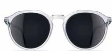
crystal clear / black ink / 1040 / grey

MODEL: T614 SIZE: 52 / 18 / 140 MATERIAL: naturalPX/ stainless steel