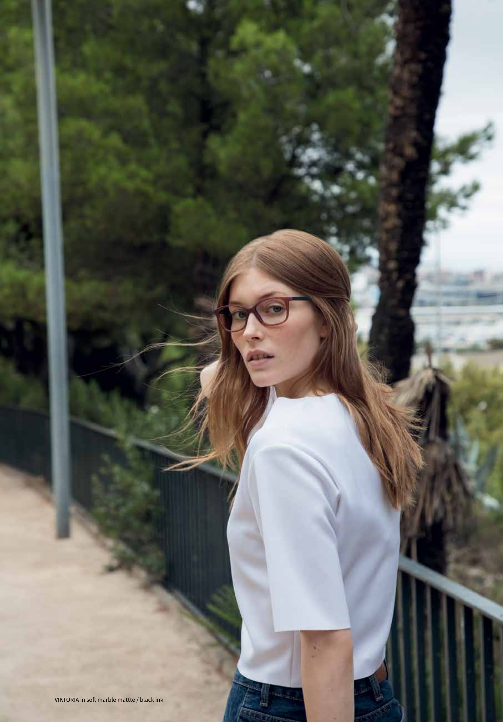
VIKTORIA in soft marble mattte / black ink