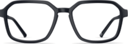
black coal matte / 9200

MODEL: T046 SIZES: 52/16/135 54/17/140 MATERIAL: naturalPX