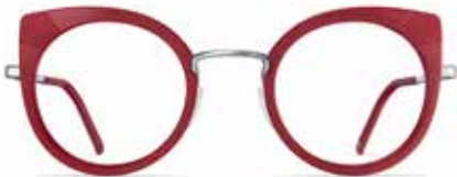
electric red / eclectic silver / 3210

MODEL: T052 SIZE: 46 / 22 / 140 MATERIAL: stainless steel + 3D