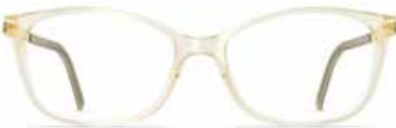
fizzy champagne / gold / 8530

MODEL: T040 SIZES: 52/15/135 54/16/135 MATERIAL: naturalPX/ stainless steel