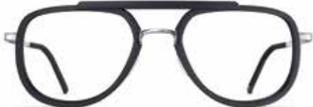
black coal / eclectic silver / 9210

MODEL: T049 SIZE: 52 / 19 / 140 MATERIAL: stainless steel + 3D