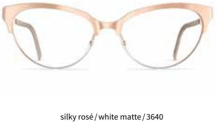
silky rosé / white matte / 3640