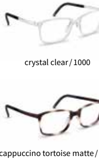
crystal clear / 1000