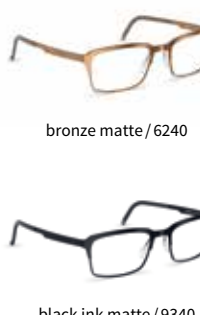
bronze matte / 6240