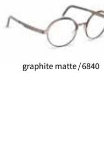
graphite matte / 6840