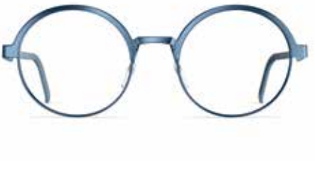
pacific blue matte / 4740