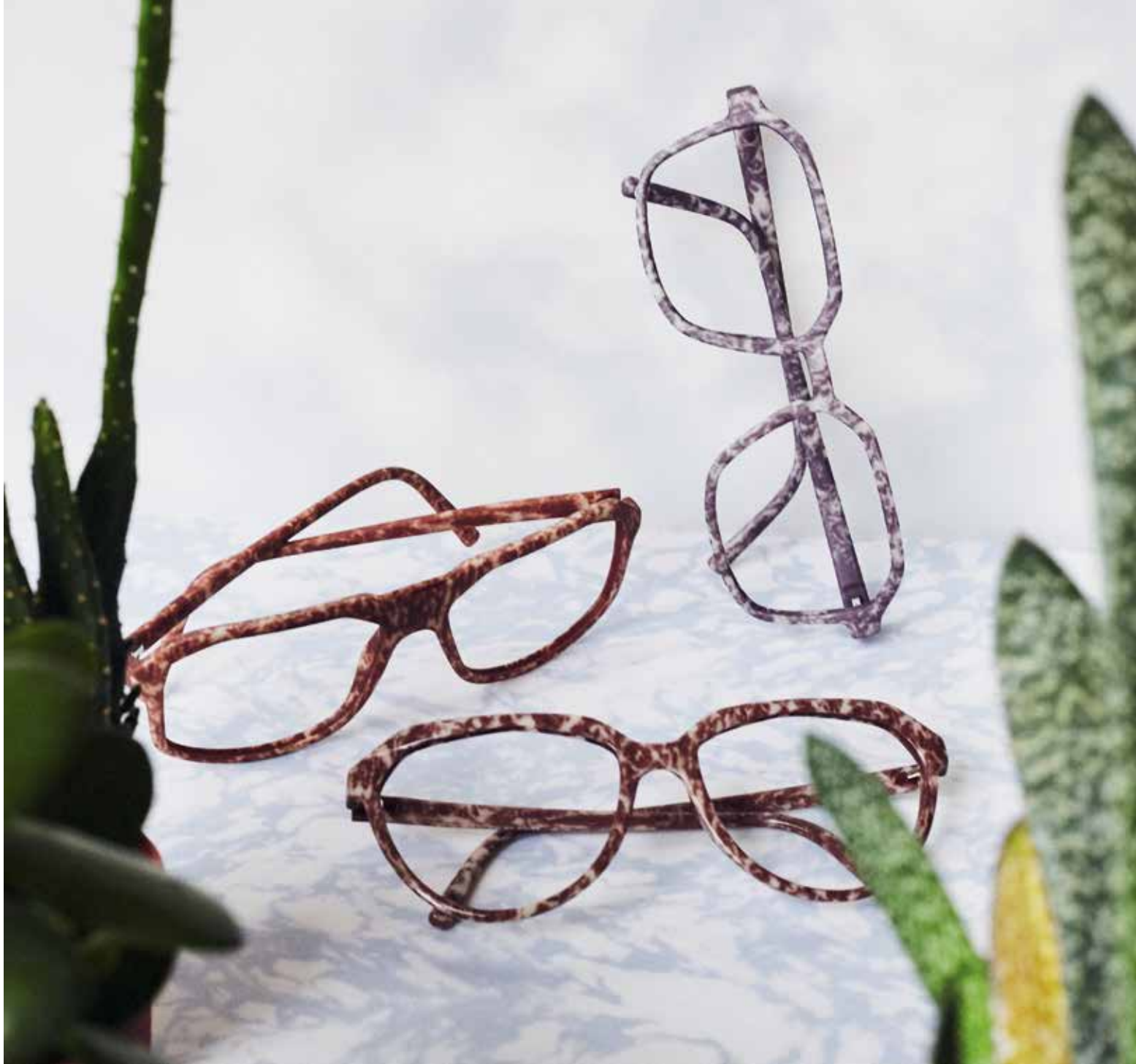
FRANK in cappuccino marble matte JANNIS in grey marble matte SANDRA in mocca marble