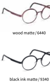
wood matte / 6440