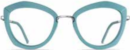
mint / eclectic silver / 5210

MODEL: T051 SIZE: 49 / 20 / 140 MATERIAL: stainless steel + 3D