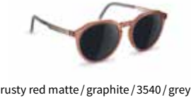
rusty red matte / graphite / 3540 / grey