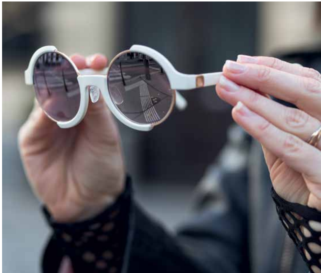
SIGMUND & CARL in snow-white / silky rosé

“I LOVE ITS MIX OF THE CLASSIC AND THE MODERN.”