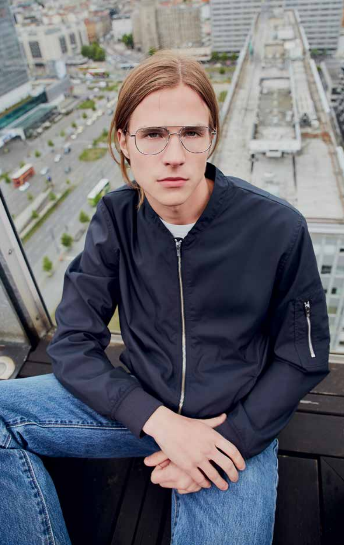
ERWIN in eclectic silver