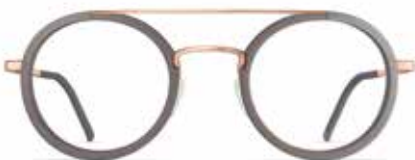
grey / silky rosé 6630

MODEL: T054 SIZE: 46 / 23 / 140 MATERIAL: stainless steel + 3D