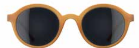
sweet honey matte / 6130 / grey

MODEL: T616 SIZE: 46 / 21 / 140 MATERIAL: naturalPX