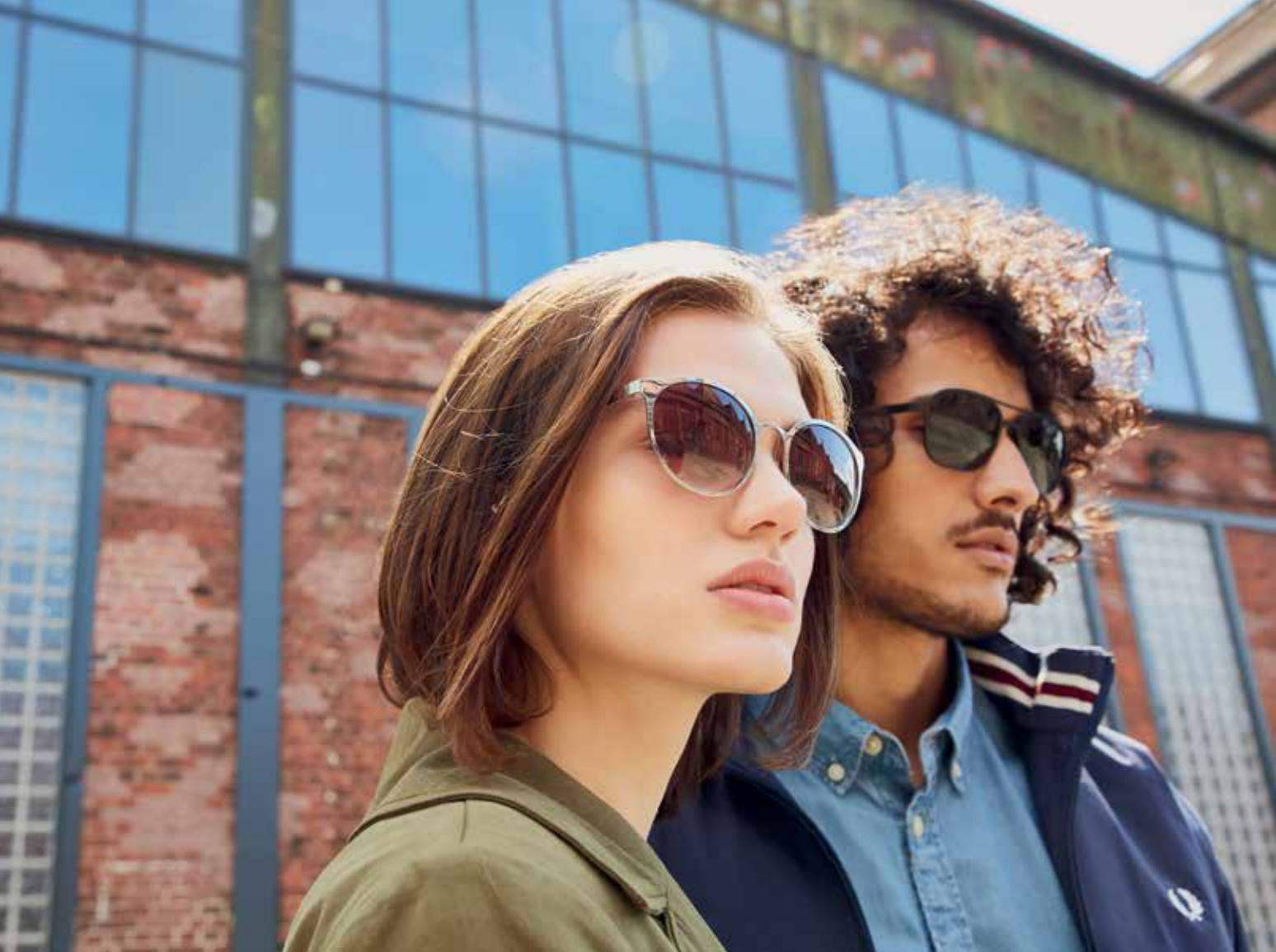
FRIDA in eclectic silver EDMUND in black ink matte