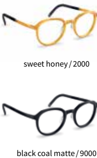
sweet honey / 2000