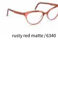
rusty red matte / 6340