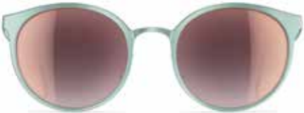
agave green matte / 5540 / rosé gold gradient mirror

MODEL: T609 SIZE: 52 / 20 / 135 MATERIAL: stainless steel