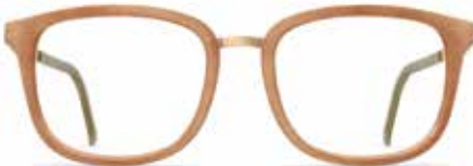
nude marble matte / gold / 6030

MODEL: T017 SIZES: 51/18/135 53/18/145 MATERIAL: naturalPX/ stainless steel