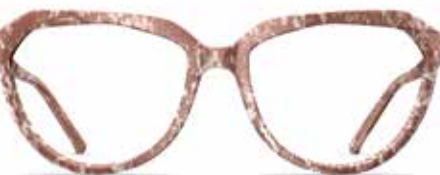
mocca marble / 6100

MODEL: T045 SIZES: 53/16/135 55/16/135 MATERIAL: naturalPX