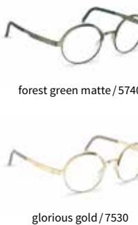
forest green matte / 5740