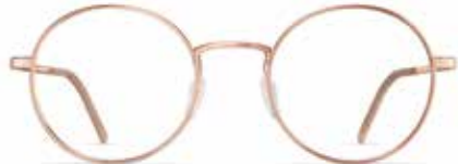
silky rosé / 3530

MODEL: T038 SIZES: 47 / 19 / 135 49 / 20 / 140 MATERIAL: stainless steel