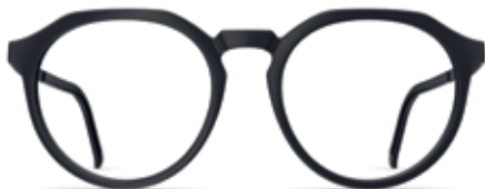
black coal matte / black ink / 9040

MODEL: T041 SIZES: 50/18/135 52/18/145 MATERIAL: naturalPX/ stainless steel