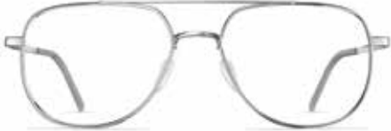
eclectic silver / 7010

MODEL: T036 SIZES: 53 / 16 / 135 55 / 16 / 140 MATERIAL: stainless steel