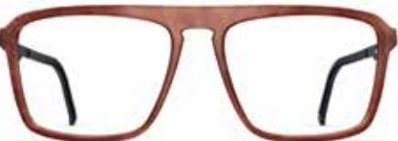
soft marble matte / black ink / 6140

MODEL: T060 SIZES: 57/16/140 MATERIAL: naturalPX/ stainless steel