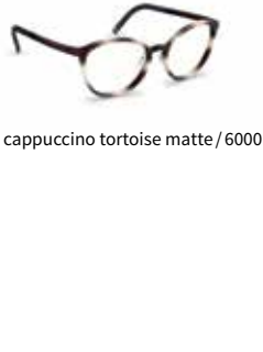
cappuccino tortoise matte / 6000