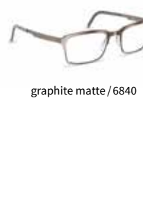
graphite matte / 6840