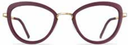
roasted berry / glorious gold / 6030

MODEL: T050 SIZE: 49 / 20 / 140 MATERIAL: stainless steel + 3D