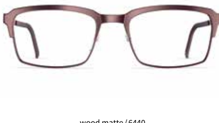
wood matte / 6440