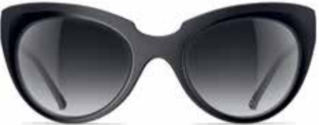
black matte catty / 9400 / grey gradient

MODEL: T612 SIZE: 53 / 21 / 135 MATERIAL: naturalPX