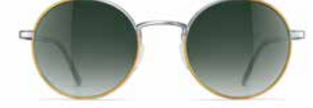
eclectic silver / honey / 7240 / green gradient

MODEL: T620 SIZE: 49 / 20 / 140 MATERIAL: stainless steel