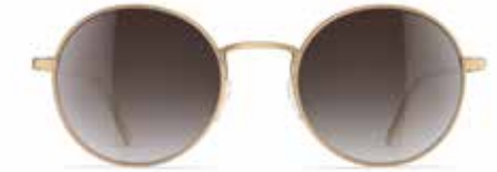
gold matte / 7630 / brown gradient

MODEL: T619 SIZE: 49 / 20 / 140 MATERIAL: stainless steel