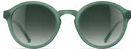
moss green matte / 5600 / green gradient

MODEL: T611 SIZE: 49 / 22 / 135 MATERIAL: naturalPX