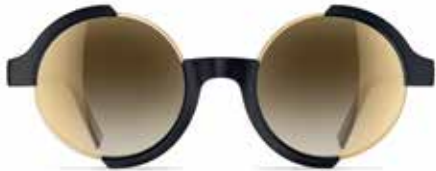
black coal matte / glorious gold / 9130 / gold gradient mirror

MODEL: T617 SIZE: 48/21/140 MATERIAL: naturalPX/ stainless steel