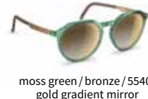
moss green / bronze / 5540 / gold gradient mirror