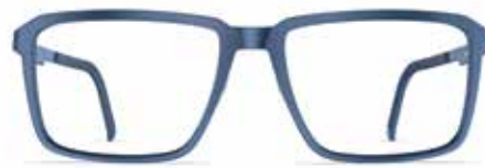
denim matte / 4940

MODEL: T044 SIZES: 53 / 17 / 135 55 / 17 / 145 MATERIAL: stainless steel