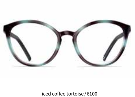
iced coffee tortoise / 6100