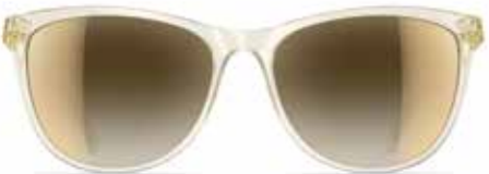
fizzy champagne / 8530 / gold gradient mirror

MODEL: T610 SIZE: 56 / 15 / 135 MATERIAL: naturalPX