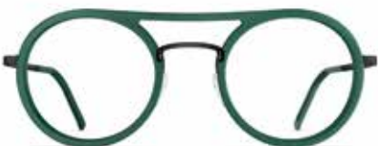
evergreen / black ink matte / 5740

MODEL: T053 SIZE: 47 / 22 / 140 MATERIAL: stainless steel + 3D