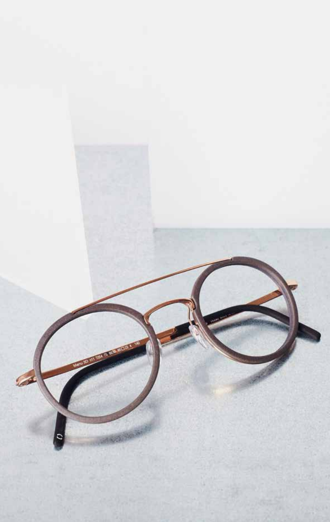
MANU 3D in grey / silky rosé