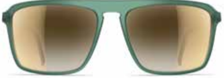
moss green matte / bronze / 5640 / gold gradient mirror

MODEL: T615 SIZE: 57 / 16 / 140 MATERIAL: naturalPX/ stainless steel