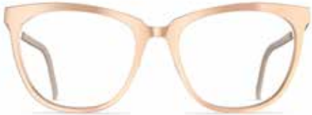
silky rosé matte / 3540

MODEL: T042 SIZES: 53/16/135 55/17/135 MATERIAL: stainless steel