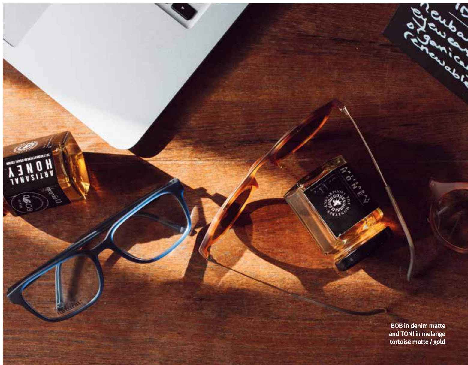
BOB in denim matte and TONI in melange tortoise matte / gold