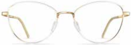
glorious gold / white / 7630

MODEL: T037 SIZES: 50 / 17 / 135 52 / 17 / 140 MATERIAL: stainless steel