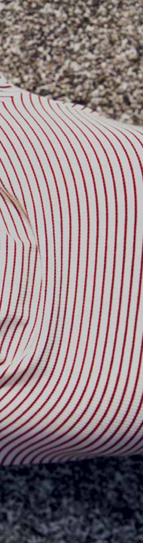
FRIDA in white / gold matte