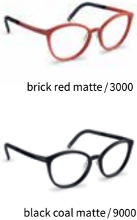
brick red matte / 3000