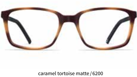
caramel tortoise matte / 6200