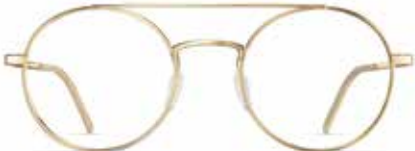
glorious gold / 7530

MODEL: T039 SIZES: 47 / 19 / 135 49 / 20 / 140 MATERIAL: stainless steel