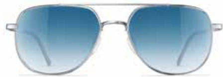
eclectic silver / 7110 / blue gradient

MODEL: T618 SIZE: 55 / 16 / 140 MATERIAL: stainless steel