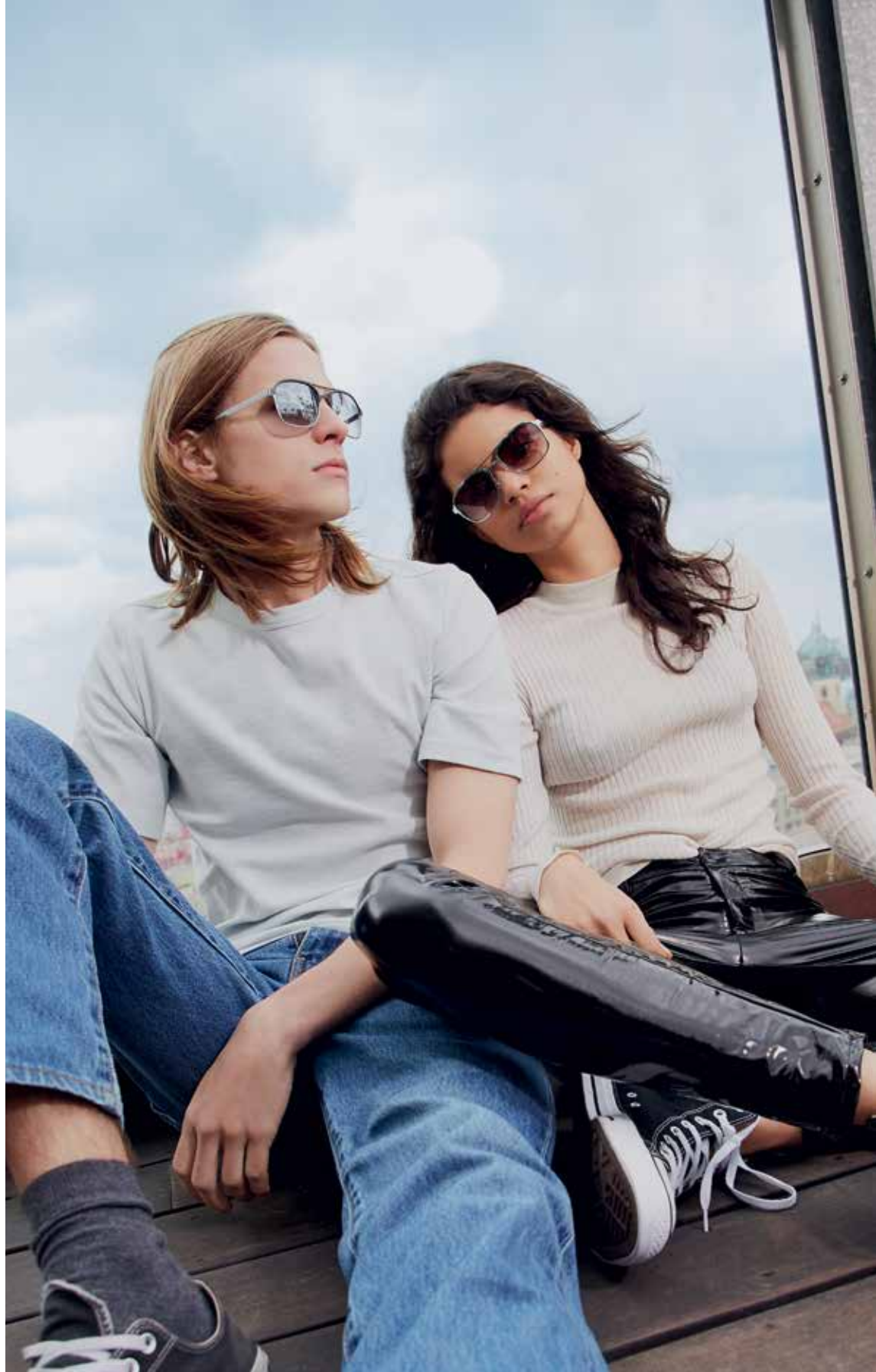
EDMUND in black ink / silver matte and eclectic silver