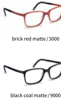
brick red matte / 3000