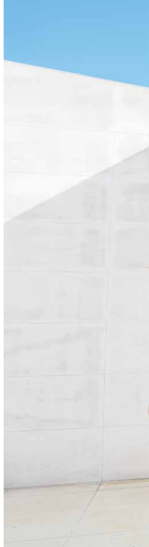
SARAH 3D in roasted berry / black ink ERWIN 3D in black coal / glorious gold MANU 3D in denim / black ink matte