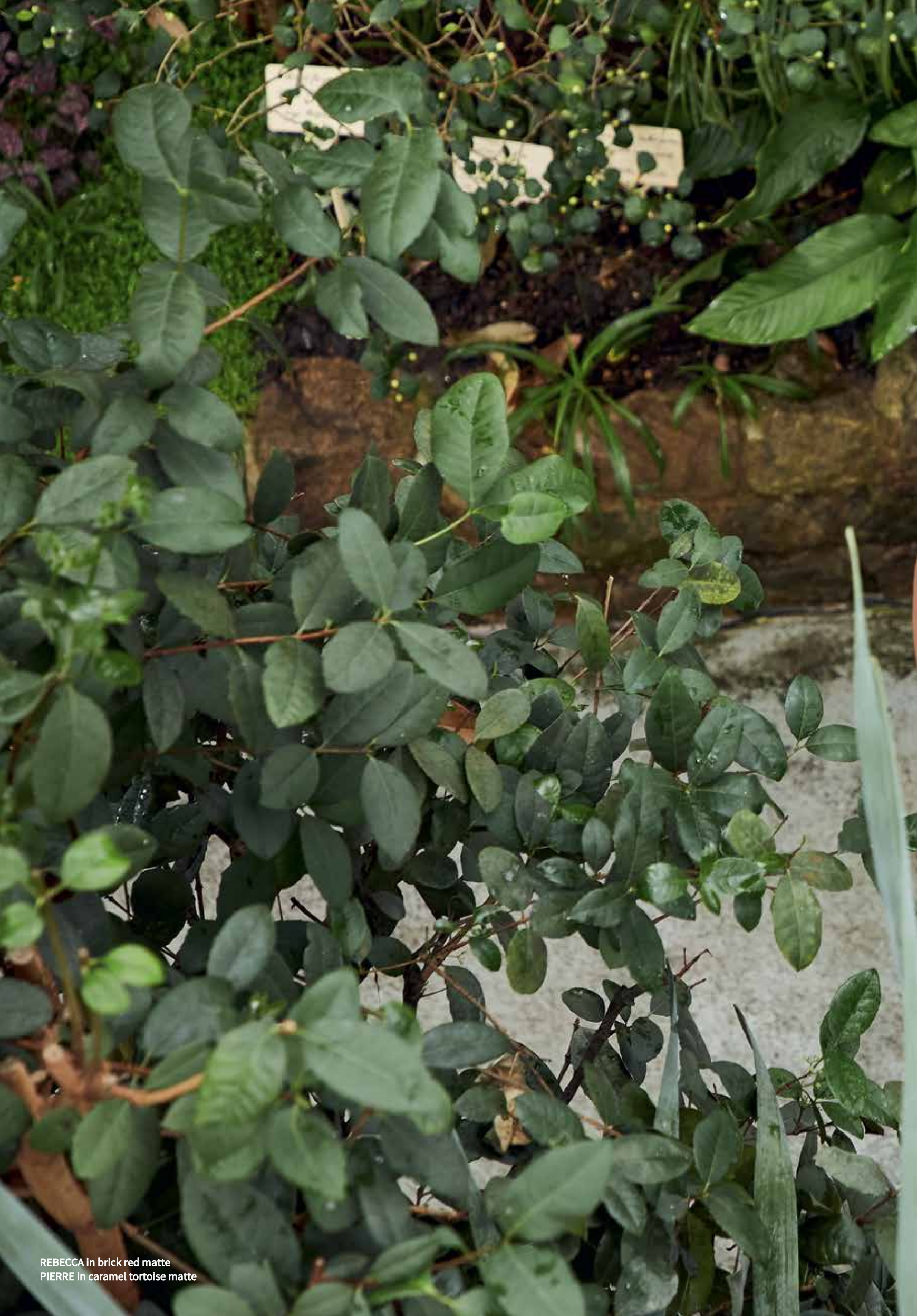
REBECCA in brick red matte PIERRE in caramel tortoise matte