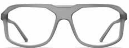
stone grey matte / 6800

MODEL: T047 SIZE: 55/15/140 MATERIAL: naturalPX