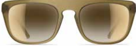
olive matte / 5530 / gold gradient mirror

MODEL: T613 SIZE: 55 / 20 / 140 MATERIAL: naturalPX