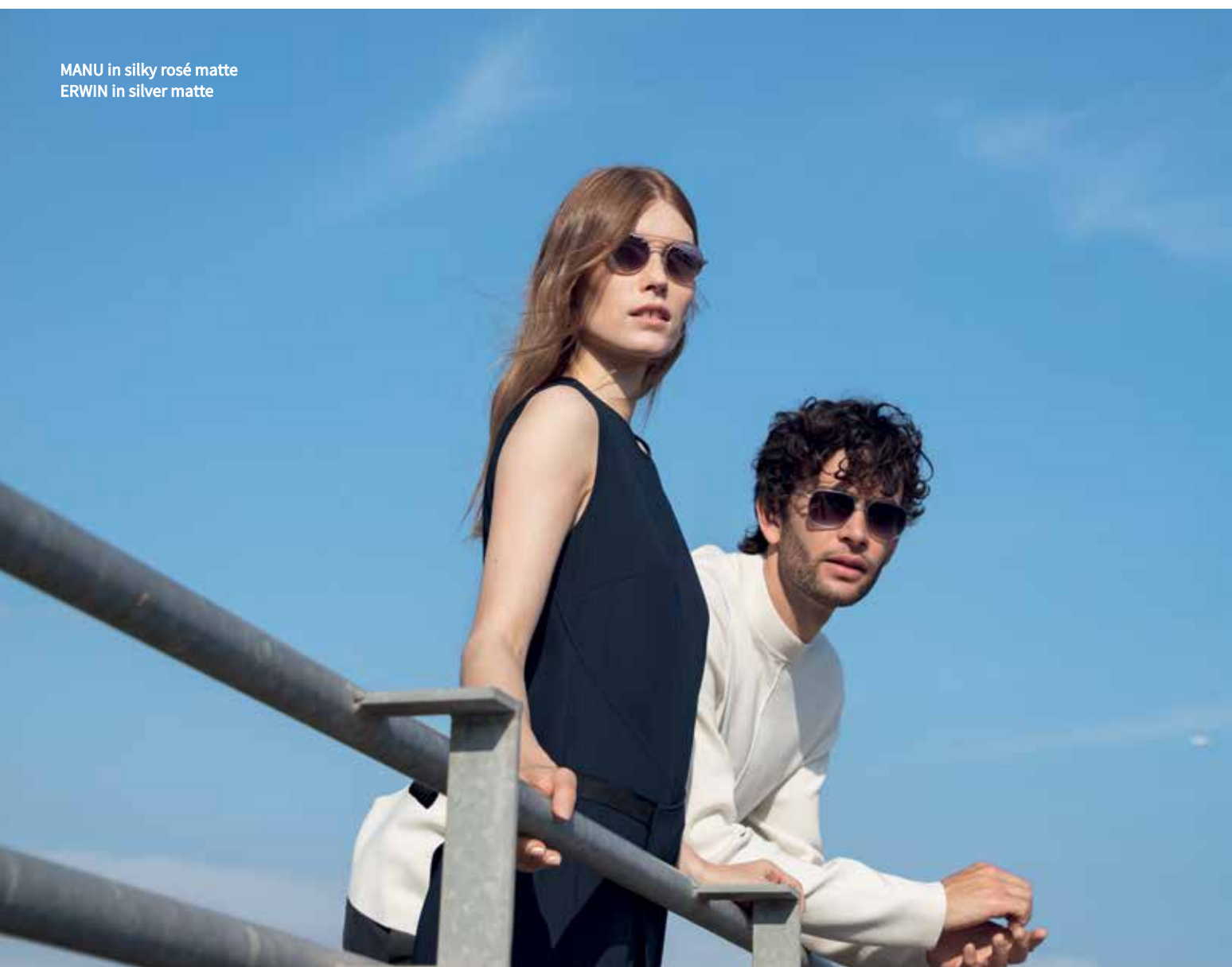
MANU in silky rosé matte ERWIN in silver matte