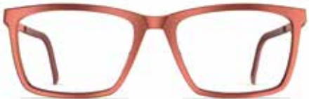
rusty red matte / 6340

MODEL: T043 SIZES: 53/17/135 55/17/145 MATERIAL: stainless steel