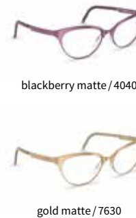
blackberry matte / 4040