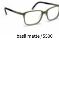
basil matte / 5500