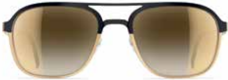
black ink / gold matte / 7540 / gold gradient mirror

MODEL: T608 SIZE: 55 / 19 / 145 MATERIAL: stainless steel