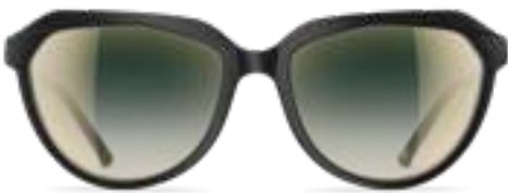
9030 black coal matte/ green gradient mirror