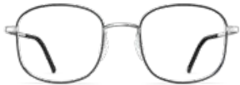
7340 eclectic silver/black