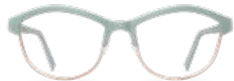
5030 jade matte/silky rose

Model T072 Size 54/17/130 Materials naturalPX stainless steel