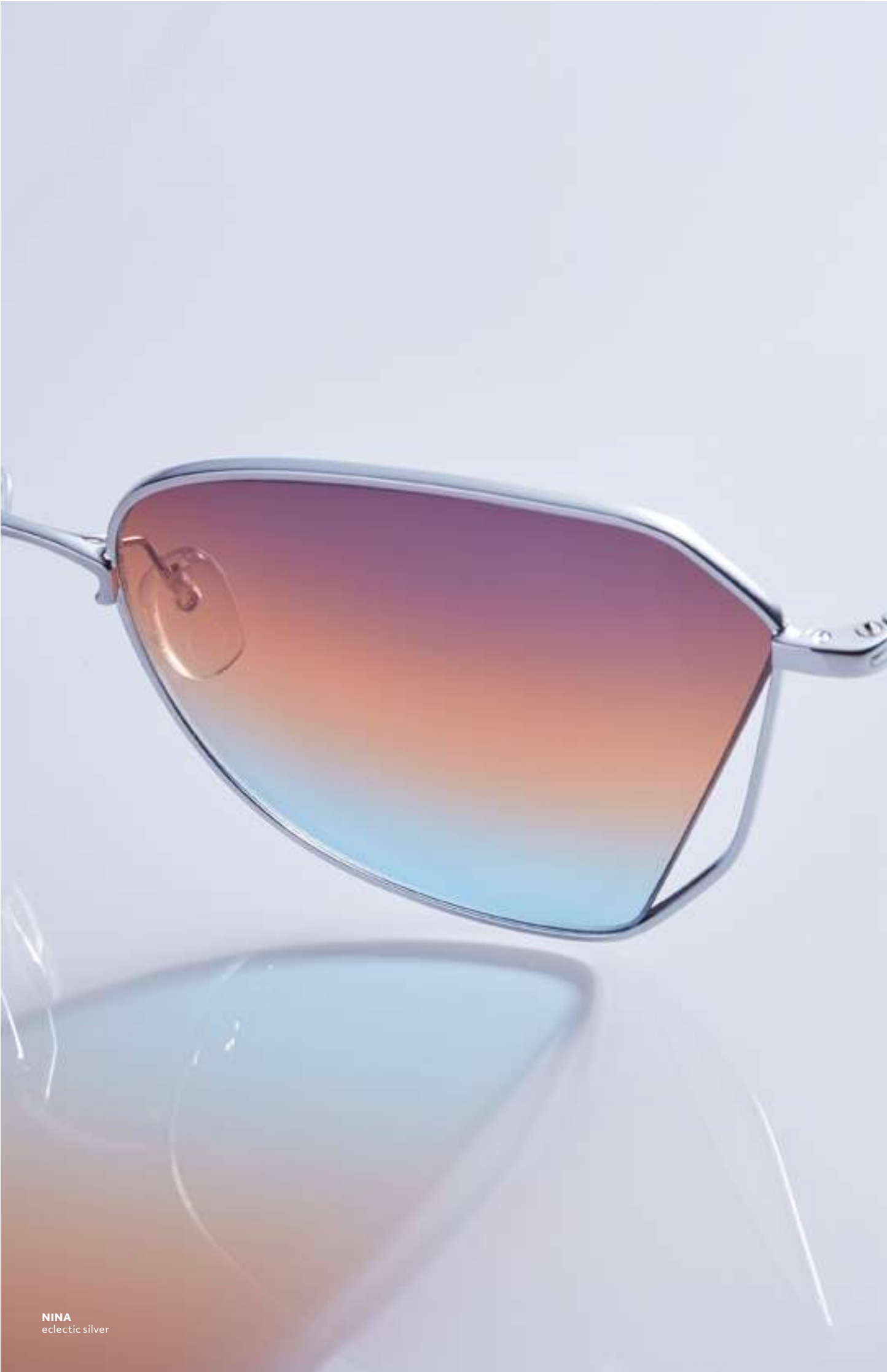
NINA eclectic silver