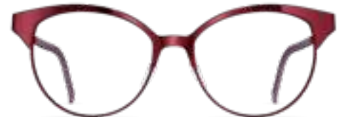
3040 ruby red

Model T063 Sizes 52/16/135 54/16/140 Material stainless steel