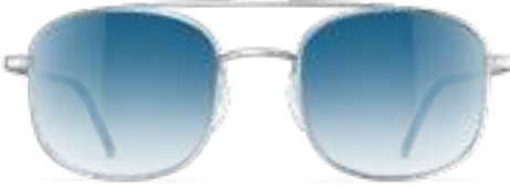
7010 eclectic silver / blue gradient

Model T629 Size 52/21/140 Materials stainless steel