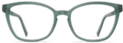
5060 ivy green matte/graphite