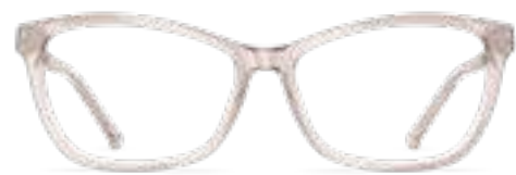
8500 crystal taupe

Model T061 Sizes 53/14/135 56/14/135 Material naturalPX