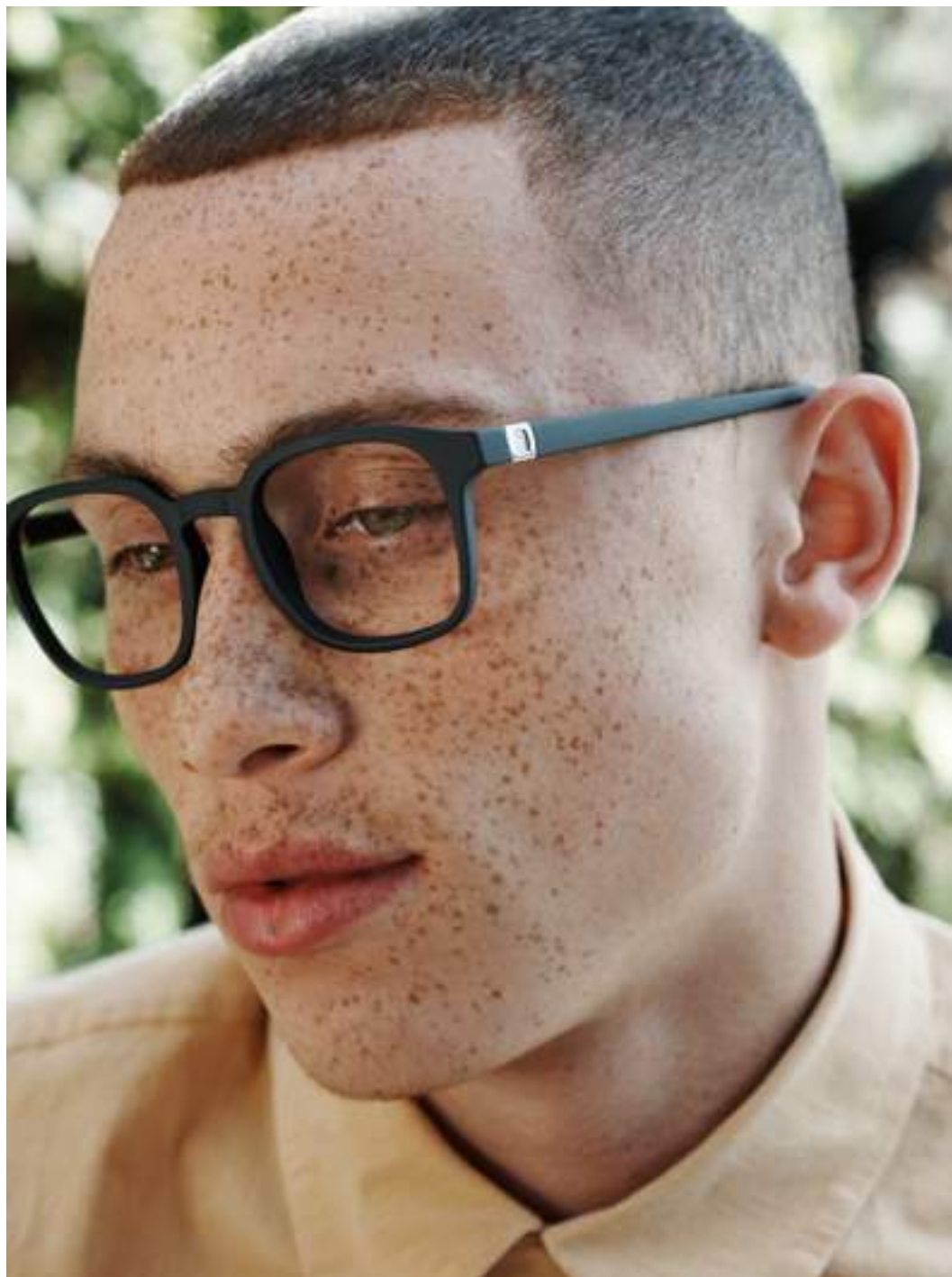
ADAM black coal matte/silver