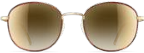
7540 glorious gold / brown tortoise / gold gradient mirror

Model T628 Size 53/20/140 Material stainless steel