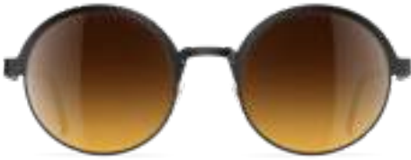
9240 black ink matte/yellow-brown gradient