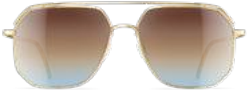
7630 glorious gold/blue-brown gradient