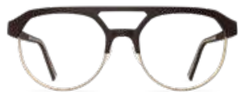
6030 dark chocolate matte/gold

Model T073 Size 54/18/140 Materials naturalPX stainless steel