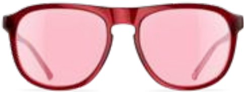
3000 ruby red / pink

Model T632 Size 56 / 17 / 140 Material naturalPX