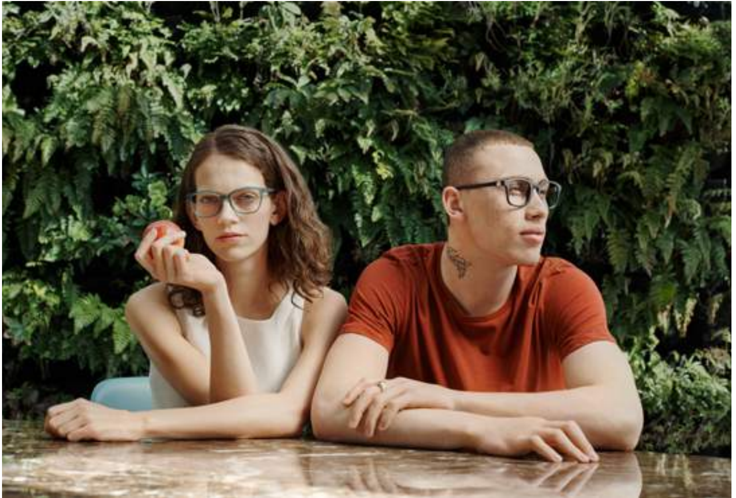
EVA ivy green matte/graphite