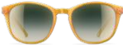
2030 sweet honey / green gradient mirror

Model T630 Size 52/18/140 Material natural PX