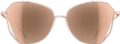
3530 silky rose/bronze mirror