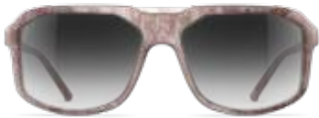
6500 washed grey / grey gradient

Model T626 Size 55/15/140 Material naturalPX