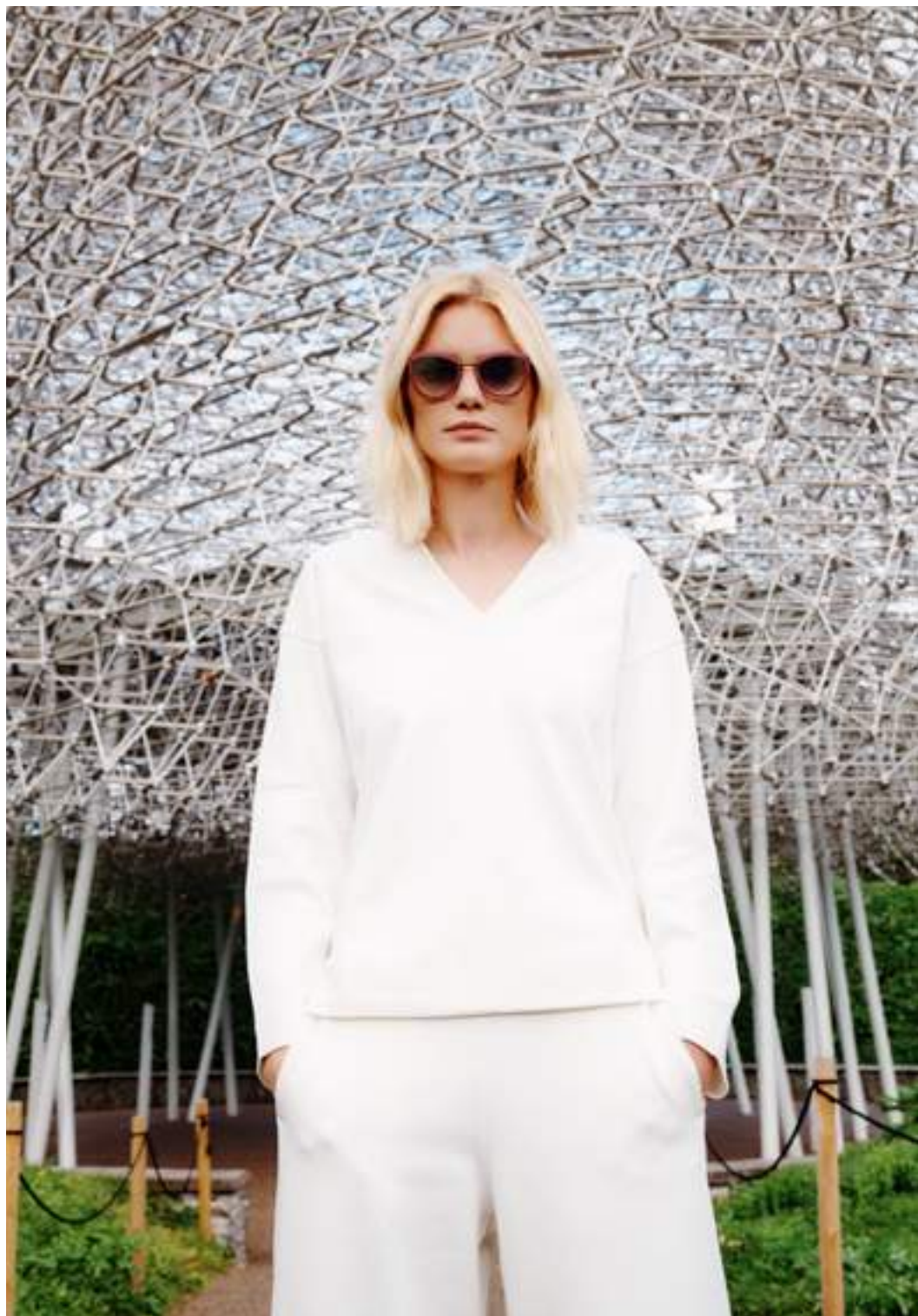
SARAH3D roasted berry/black coal