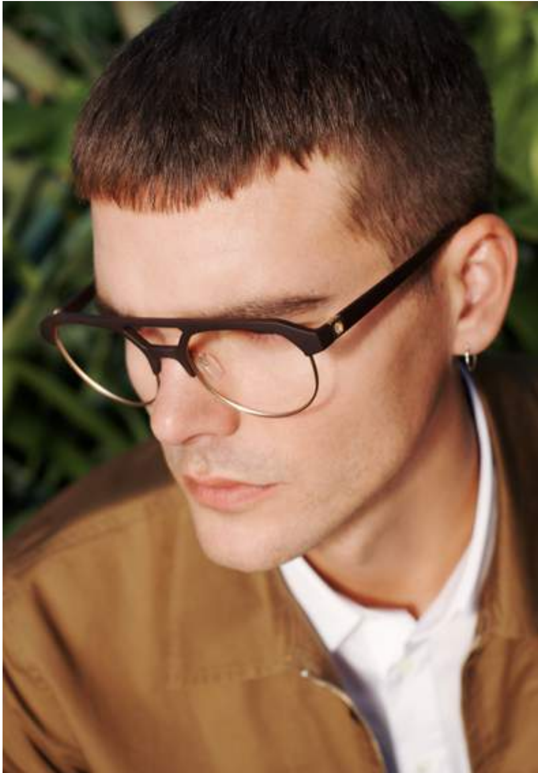
GIOVANNI dark chocolate matte / gold