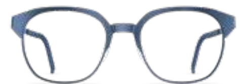
4540 denim matte

Model T064 Sizes 51/19/135 53/20/145 Material stainless steel