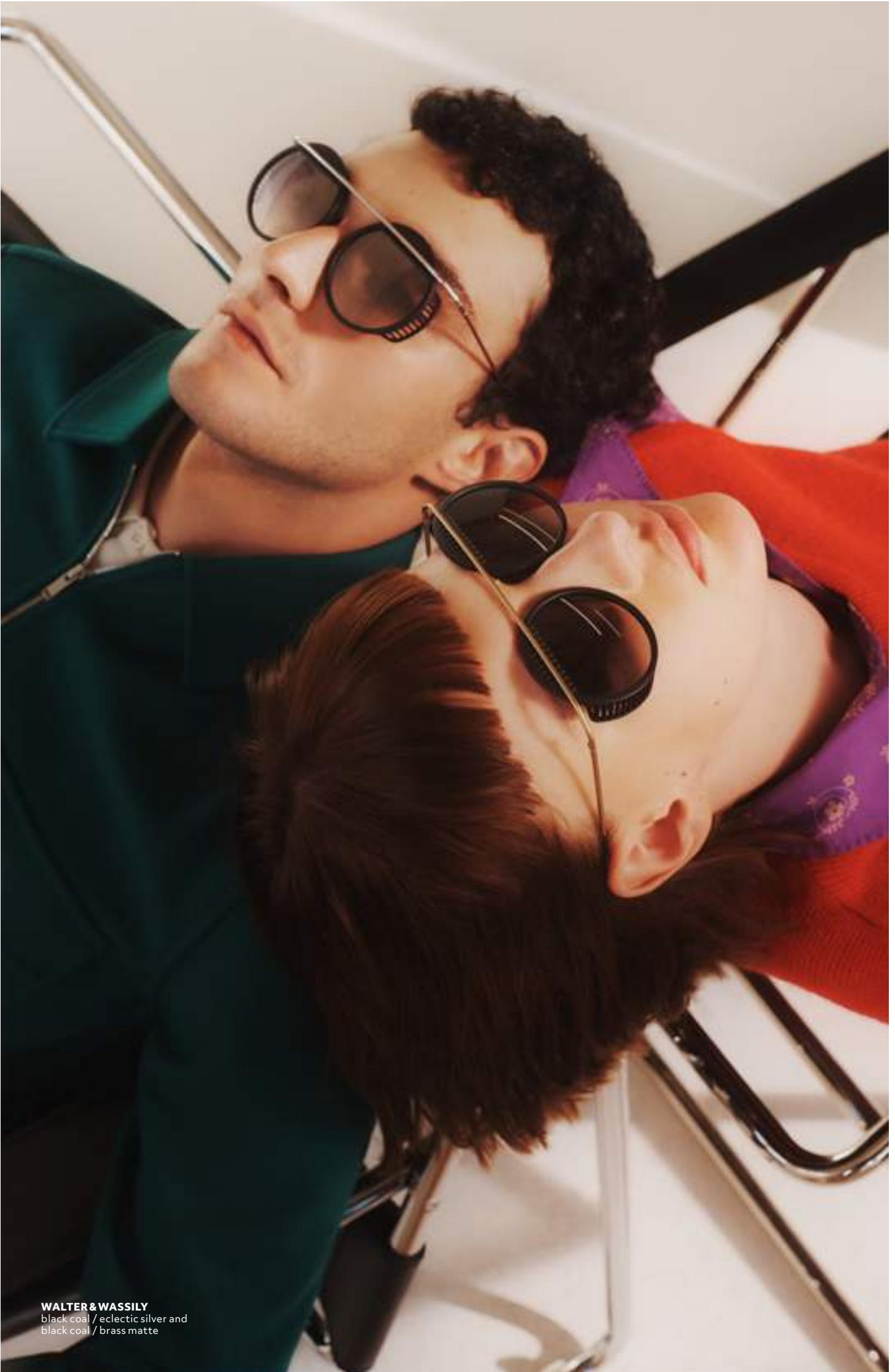
WALTER & WASSILY black coal / eclectic silver and black coal / brass matte