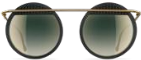
9140 black coal/brass matte/green gradient mirror