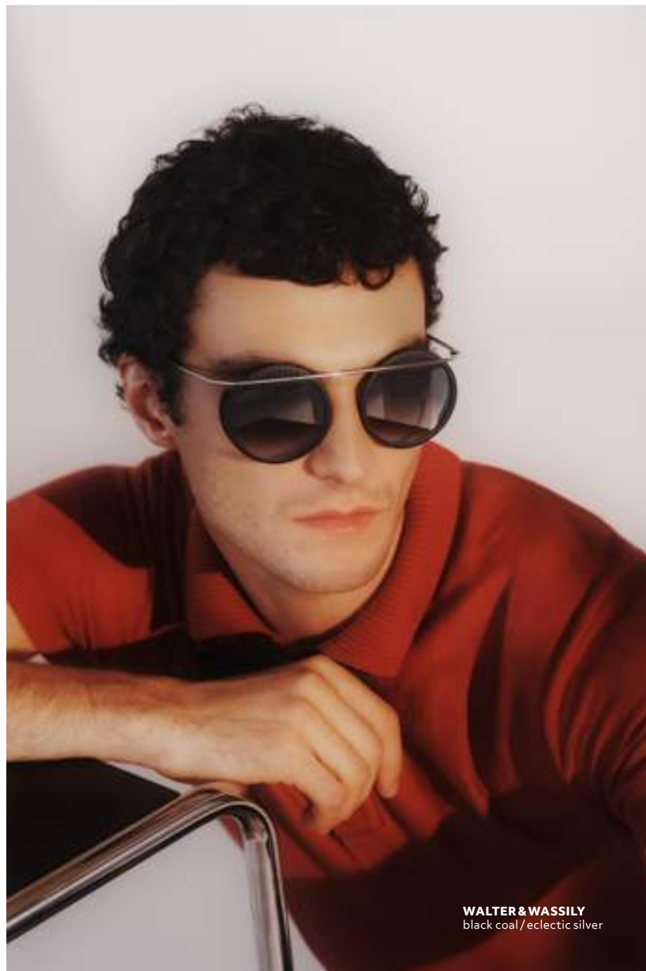
WALTER & WASSILY black coal / eclectic silver

S tylism isn't something final; it's constant change." This claim of architect Walter Gropius', from the beginning of the last century, couldn't be more true for us, either. The neubau eyewear design is characterized by constant evolution: we want to think ahead and build new bridges—like taking the chance to celebrate the 100-year anniversary of the Bauhaus, which Gropius founded in Weimar in 1919. It's hard to name another design movement that has shaped our contemporary understanding of aesthetics so profoundly while still remaining so revolutionary. Clear lines, unadorned elegance, pragmatic excellence; these are attributes that could not be closer to our own understanding of design, and also shapes our new special edition frames "Walter & Wassily", dedicated entirely to the Bauhaus.