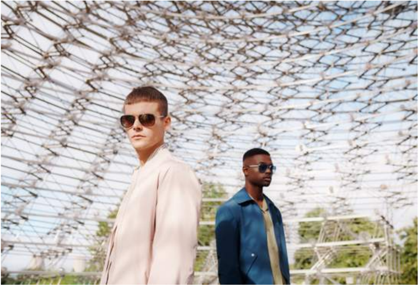
ERWIN 3D black coal / glorious gold and denim / eclectic silver