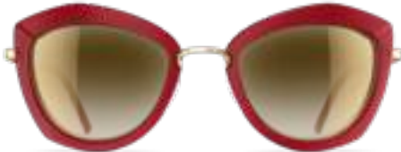
3030 electric red / glorious gold / gold gradient mirror

Model T634 Size 52/20/140 Materials 3D printed stainless steel