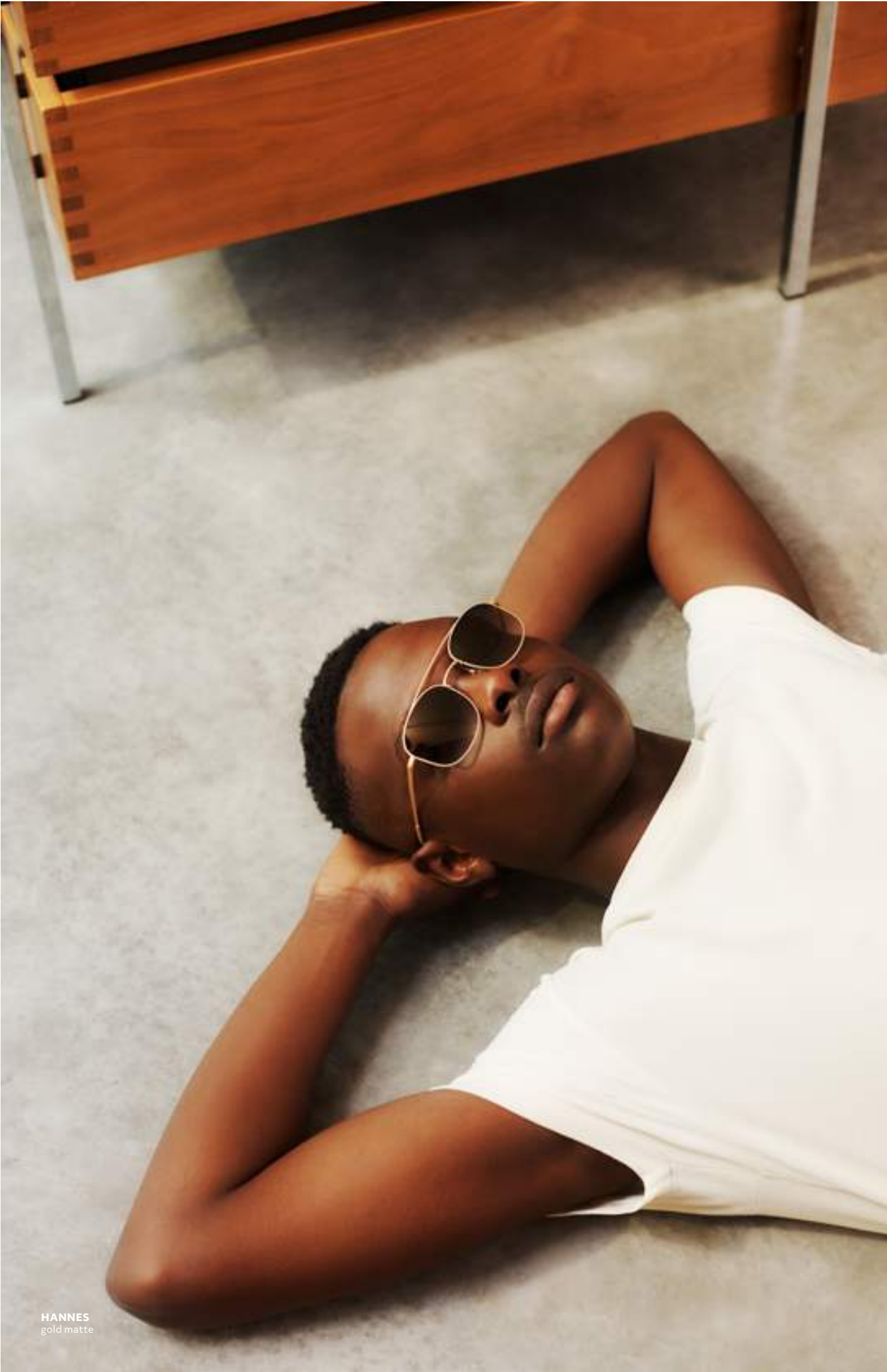
HANNES gold matte