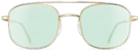
7730 glorious gold / green

Model T629 Size 52 / 21 / 140 Material stainless steel