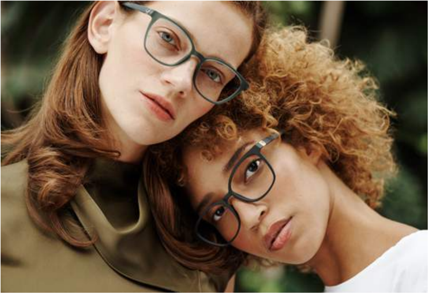
EVA ivy green matte/graphite and black coal matte/rose