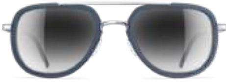
4510 denim / eclectic silver / silver gradient mirror

Model T635 Size 55/19/140 Materials 3D printed stainless steel