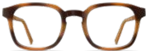
6030 caramel tortoise matte/gold