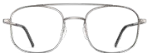
6560 graphite matte