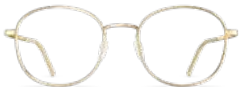
7530 glorious gold