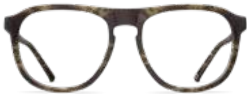
030 midnight tortoise matte

Model T062 Sizes 53/16/135 56/17/145 Material naturalPX