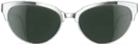
7210 eclectic silver/green