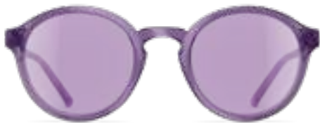
4000 ultraviolet / purple

Model T633 Size 49 / 22 / 140 Material naturalPX