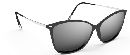
Col. / 75 9000 BLACK / RUTHENIUM SILHOUETTE LIGHT MANAGEMENT® SILVER MIRROR GRADIENT