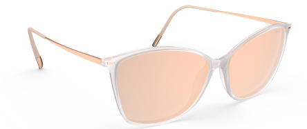
Col. / 75 8530 FROSTY WHITE / ROSE GOLD GLOSSY CARAMEL MIRROR