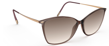
Col. / 75 6030 BROWN / GOLD CLASSIC BROWN GRADIENT