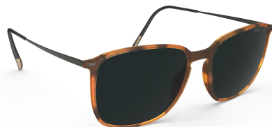
Col. / 75 6040 VINTAGE HAVANNA / BLACK SILHOUETTE LIGHT MANAGEMENT® GREY