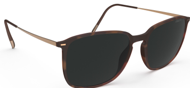
Col. / 75 6030 HAVANNA WALNUT / GOLD SILHOUETTE LIGHT MANAGEMENT® POL BROWN