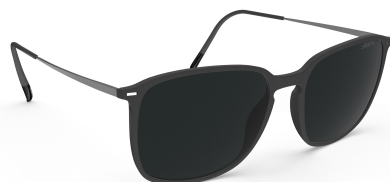
Col. / 75 9060 BLACK / RUTHENIUM SILHOUETTE LIGHT MANAGEMENT® POL GREY