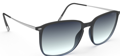
Col. / 75 9010 GREY / SILVER SILHOUETTE LIGHT MANAGEMENT® CLASSIC GREY GRADIENT