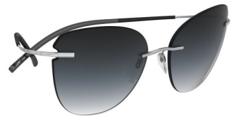
Col. / 75 6560 RUTHENIUM CLASSIC GREY GRADIENT