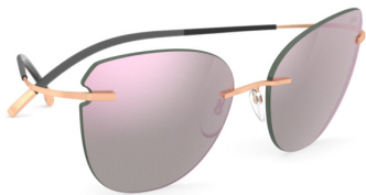
Col. / 75 3530 ROSE GOLD SILHOUETTE LIGHT MANAGEMENT® GLOSSY ROSÉ MIRROR