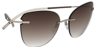
Col. / 75 7530 GOLD CLASSIC BROWN GRADIENT