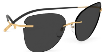
Col. / 75 7620 GOLD SILHOUETTE LIGHT MANAGEMENT® POL GREY