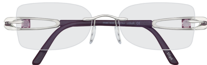
ROSE SILVER Mod. 6789/00-6050