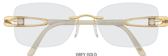
GREY GOLD Mod. 6791/20-6051