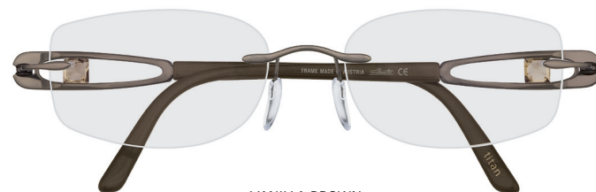
VANILLA BROWN Mod. 6790/40-6052