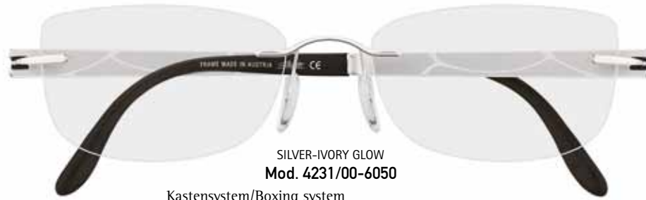
SILVER-IVORY GLOW Mod. 4231/00-6050