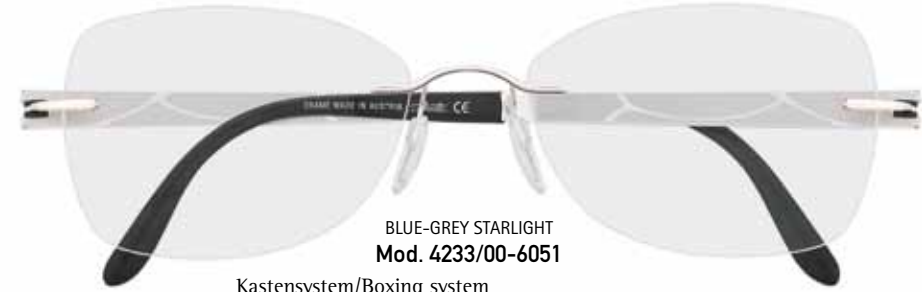
BLUE-GREY STARLIGHT Mod. 4233/00-6051