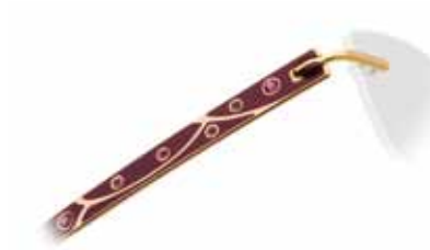
MOD. 4232/20-6052 RED-GOLDEN SPARKLE

Swarovski Xilion Flat Back Ø 2,1 and Xilion Round Ø 1,4 mm colour: Light Colorado Topaz