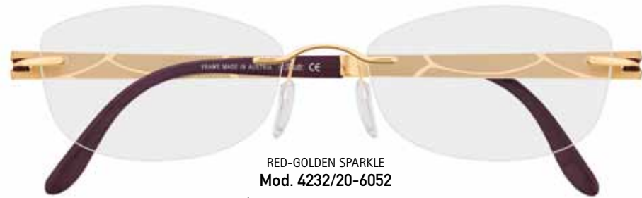
RED-GOLDEN SPARKLE Mod. 4232/20-6052