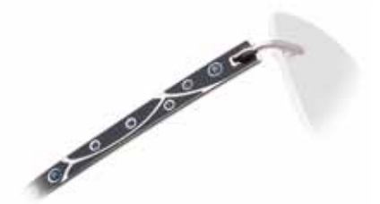
Mod. 4233/00-6051 BLUE-GREY STARLIGHT

Swarovski Xilion Flat Back Ø 2,1 and Xilion Round Ø 1,4 mm colour: Amethyst