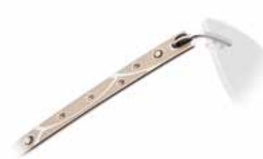
Mod. 4231/00-6050 SILVER-IVORY GLOW

metal parts rhodium shiny, China lacquer application beige, temple-ends darkbrown