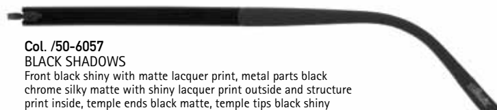
Col. /50-6057 BLACK SHADOWS Front black shiny with matte lacquer print, metal parts black chrome silky matte with shiny lacquer print outside and structure print inside, temple ends black matte, temple tips black shiny