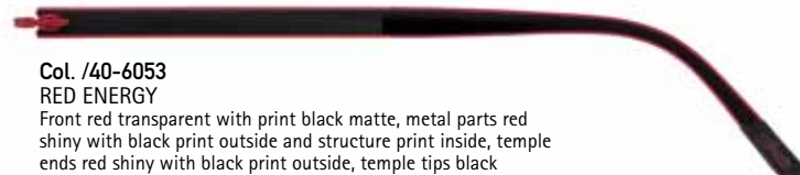
Col. /40-6053 RED ENERGY Front red transparent with print black matte, metal parts red shiny with black print outside and structure print inside, temple ends red shiny with black print outside, temple tips black