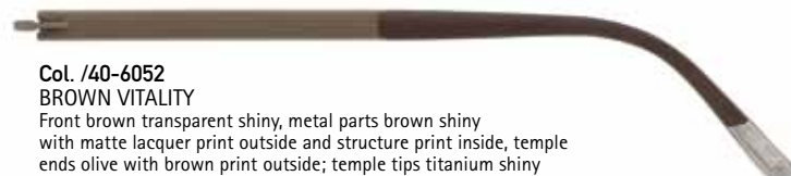
Col. /40-6052 BROWN VITALITY Front brown transparent shiny, metal parts brown shiny with matte lacquer print outside and structure print inside, temple ends olive with brown print outside; temple tips titanium shiny