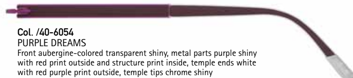
Col. /40-6054 PURPLE DREAMS Front aubergine-colored transparent shiny, metal parts purple shiny with red print outside and structure print inside, temple ends white with red purple print outside, temple tips chrome shiny