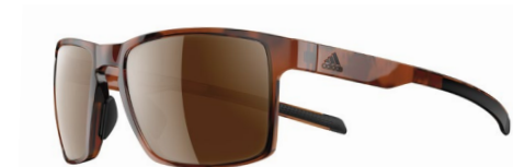
ad30 75 6000 BROWN HAVANNA BROWN