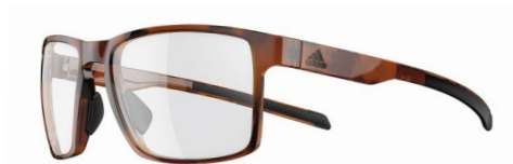
ad30 75 6100 BROWN HAVANNA VARIO (ANTIFOG) CLEAR - GREY / LENS CATEGORY: 0-3