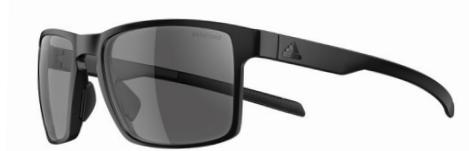
ad30 75 9200 BLACK MATT GREY POLARIZED