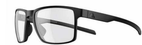
ad30 75 9300 BLACK MATT VARIO (ANTIFOG) CLEAR - GREY / LENS CATEGORY: 0-3