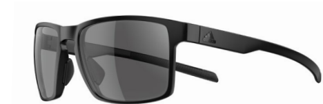
ad30 75 9000 BLACK MATT GREY