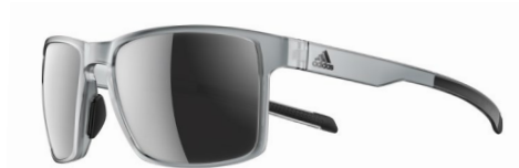
ad30 75 6500 CRYSTAL GREY CHROME MIRROR