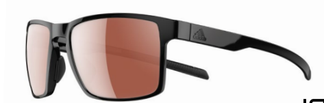
ad30 75 9100 BLACK SHINY LST LST™ ACTIVE SILVER