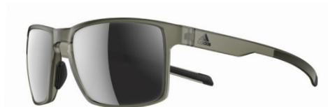
ad30 75 5500 OLIVE MATT CHROME MIRROR