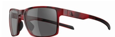
ad30 75 3000 RED HAVANNA GREY