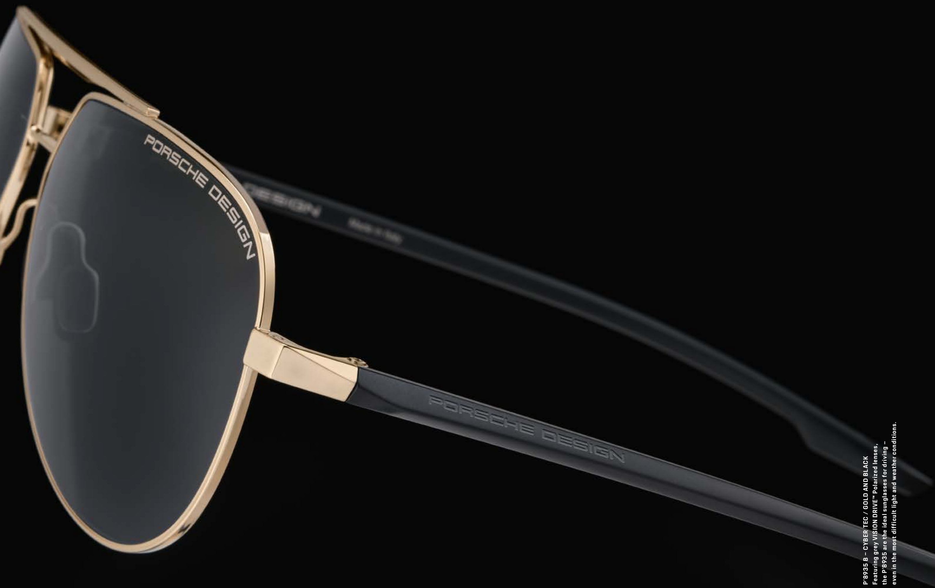
P'8935 B - CYBER TEC / GOLD AND BLACK Featuring grey VISION DRIVE™ Polarized lenses, the P'8935 are the ideal sunglasses for driving - even in the most difficult light and weather conditions.