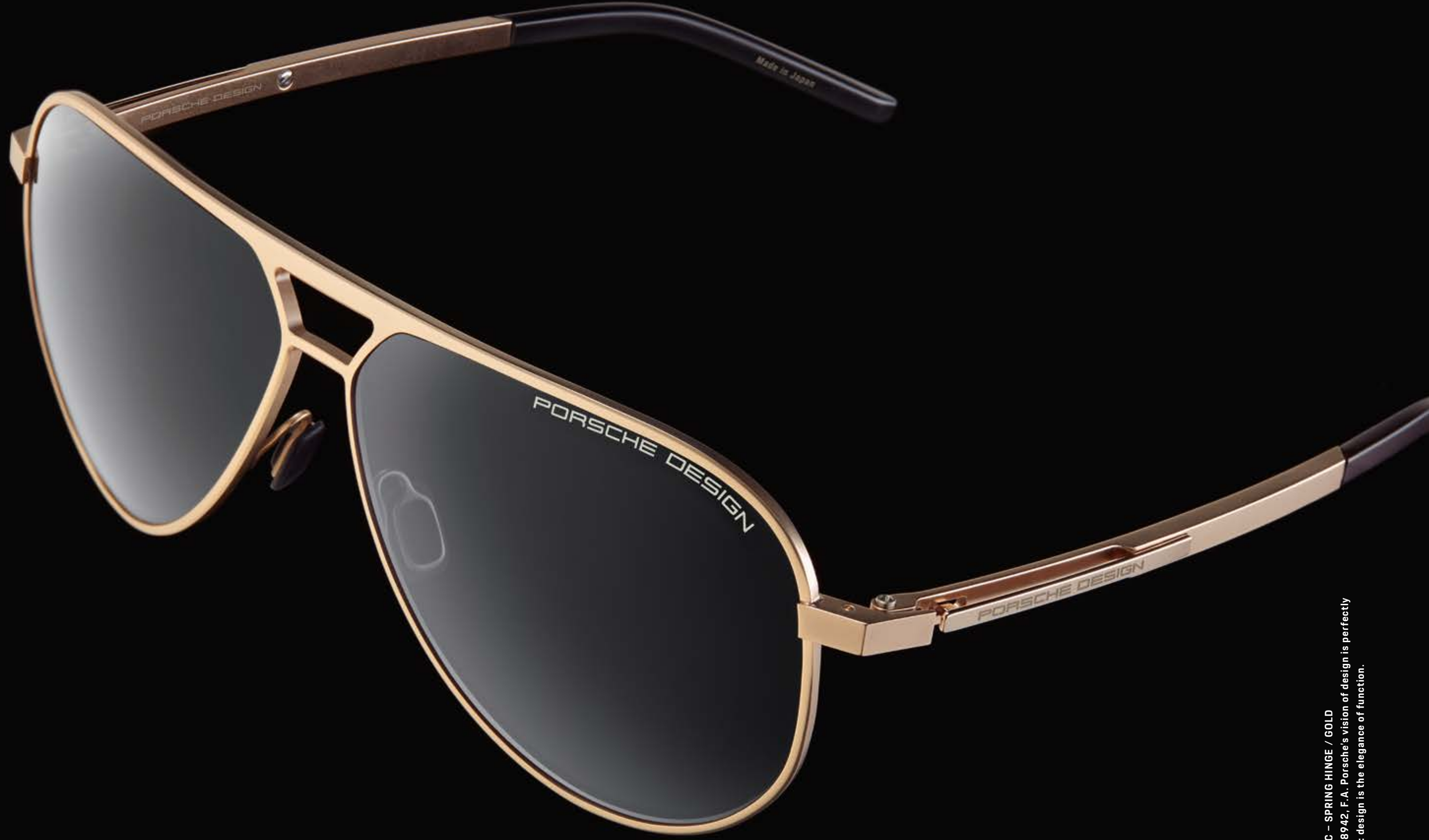
P'8942 C - SPRING HINGE / GOLD In the P'8942, F.A. Porsche's vision of design is perfectly realised: design is the elegance of function.