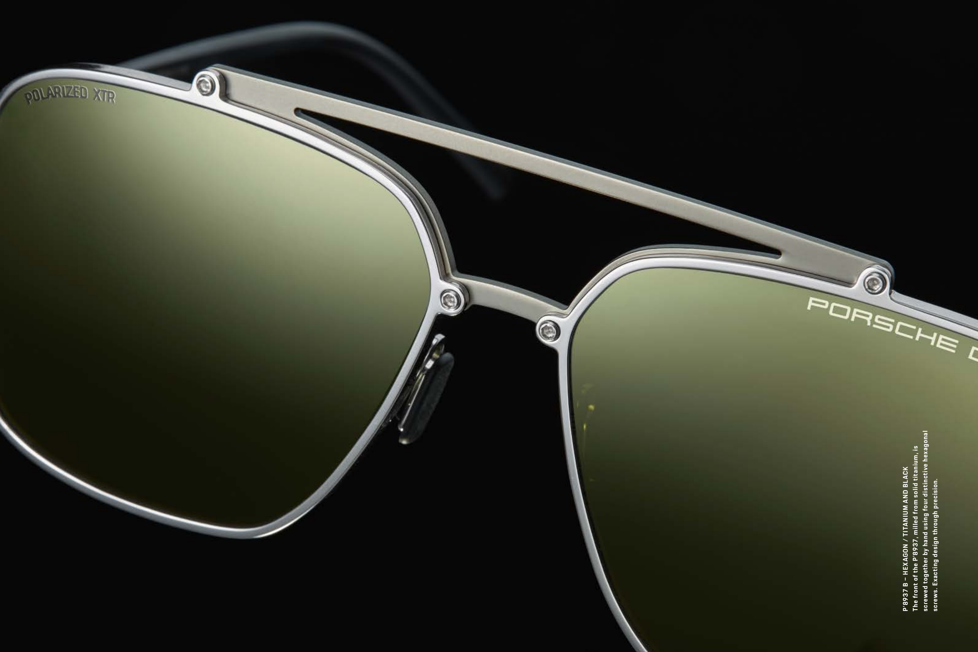
P'8937 B - HEXAGON / TITANIUM AND BLACK The front of the P'8937, milled from solid titanium, is screwed together by hand using four distinctive hexagonal screws. Exacting design through precision.