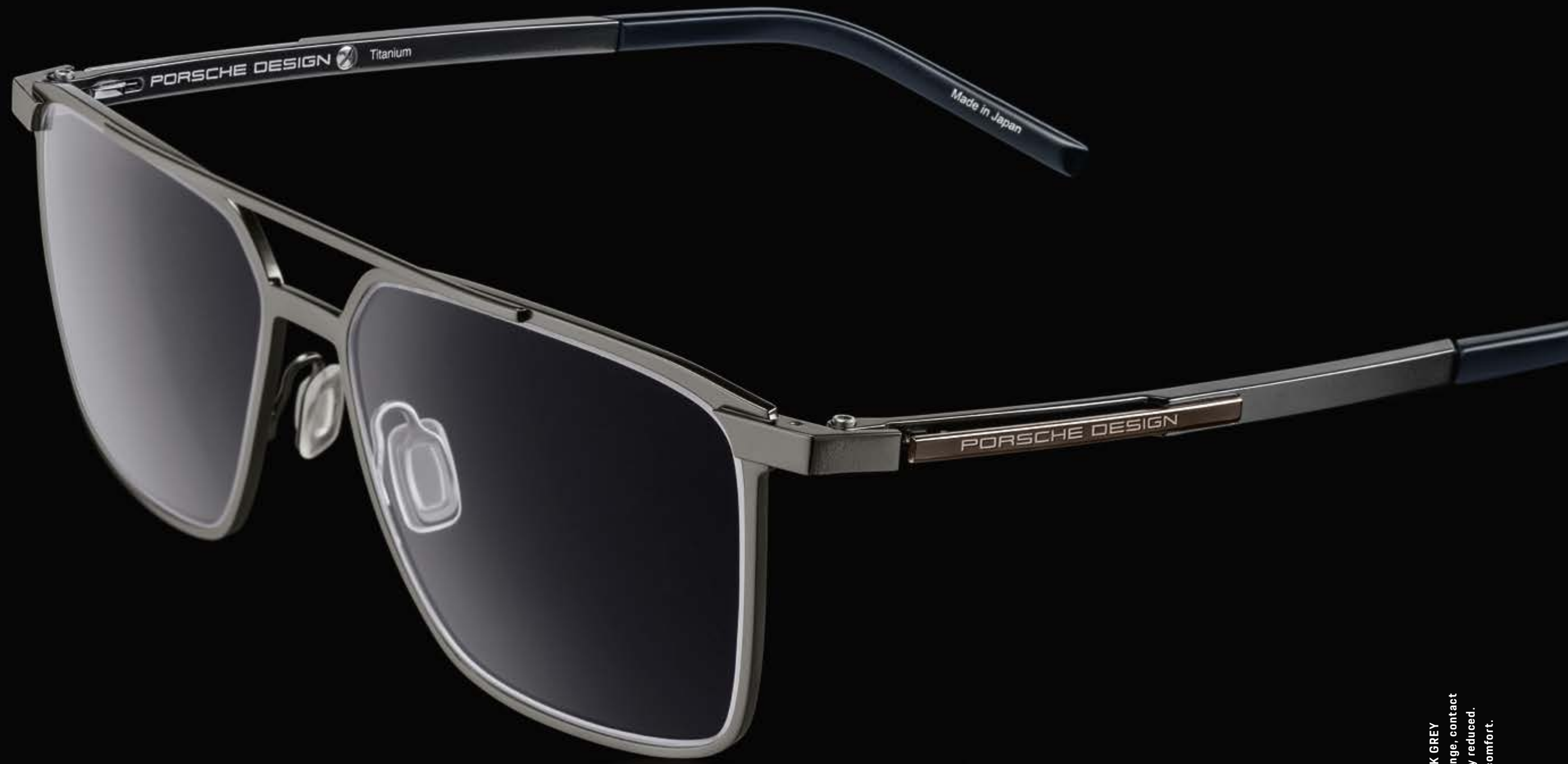
P'8392 A - SPRING HINGE / DARK GREY Thanks to the ingenious spring hinge, contact pressure on the temples is greatly reduced. This creates first-class wearing comfort.