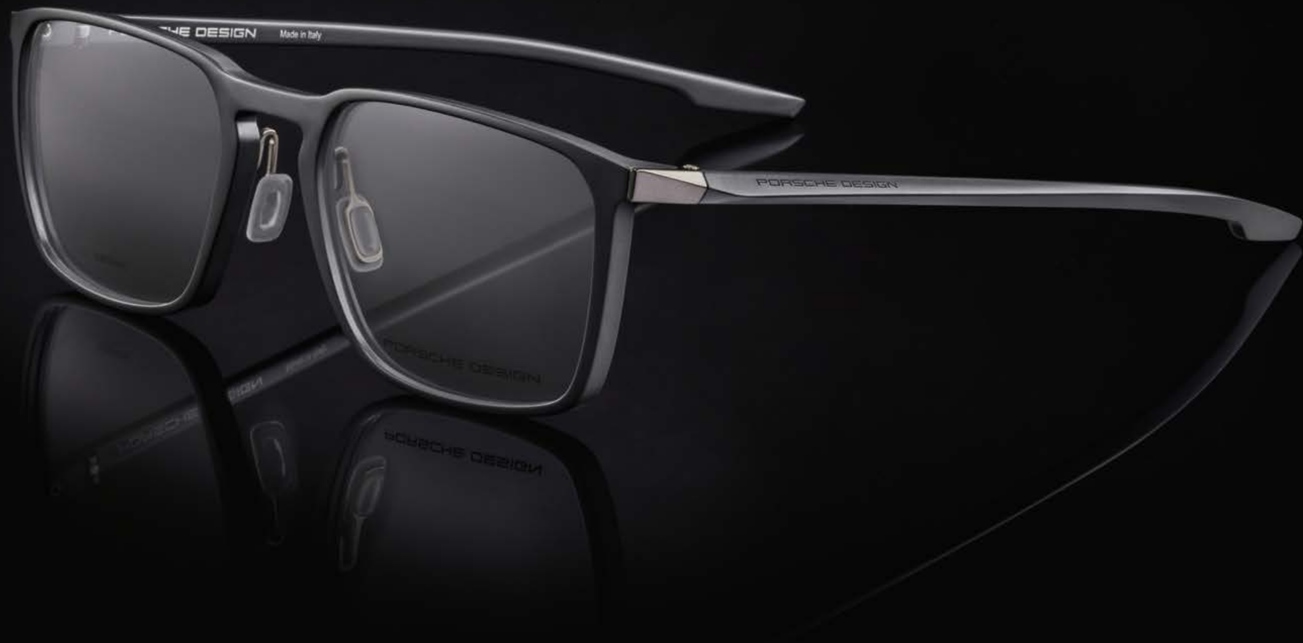
P'8732 A - CYBER TEC / BLACK The P'8732 brings together motorsport-inspired design and highest quality in perfect symbiosis.